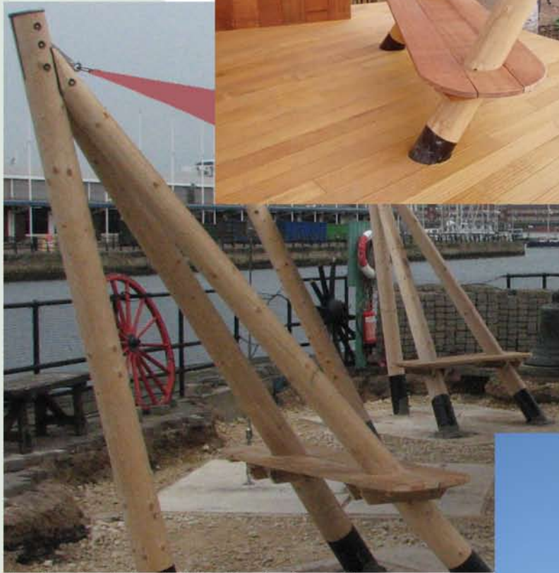
planed round pole tripod with bench, red-ochre membrane