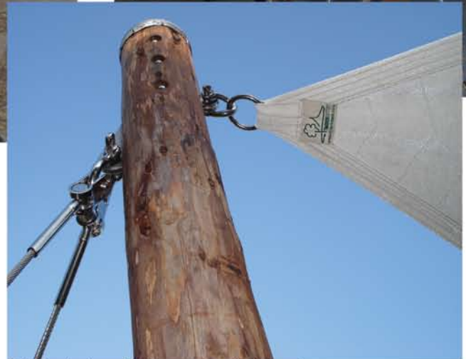
debarked poles, stainless guys, natural membrane